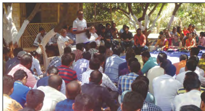
Field visit of Input Dealers at Radhe Farm at Sasan Gir