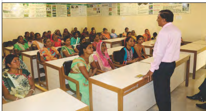
Farm Women Training Programme Under COC Scheme