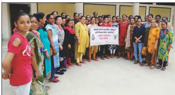
On Campus training programme at KVK Amreli