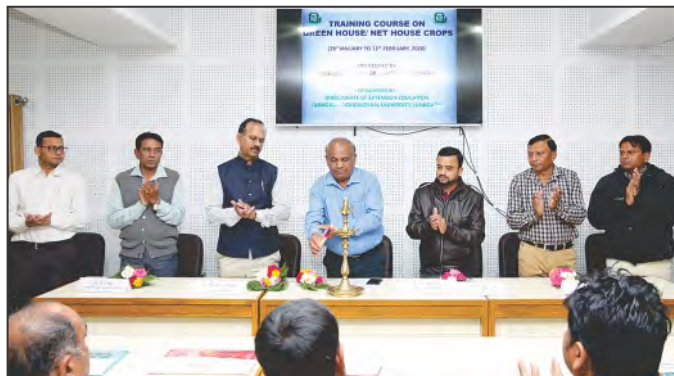
Training Programme on Green House & Net House at JAU, Junagadh