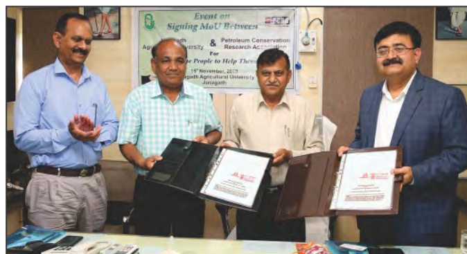
MOU with Petroleum Conservation Research Association