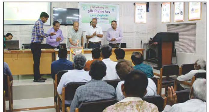
Thechnology Week Celebration by KVK Targhadiya