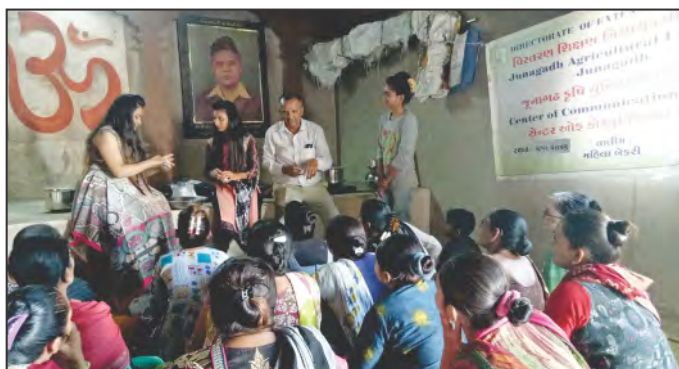
Bakery Training Under COC Scheme