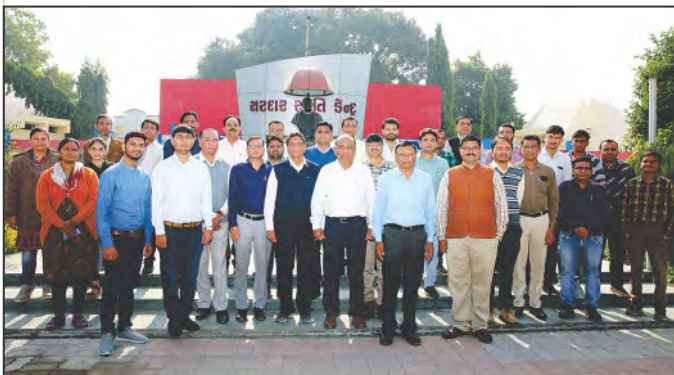
Trining Programme by EEI, Anand at JAU, Junagadh