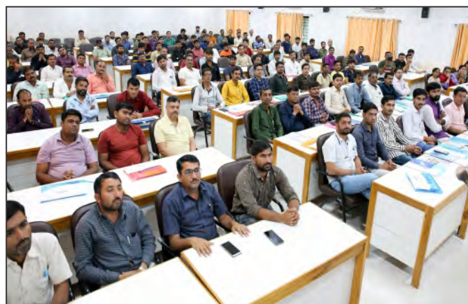
Participants of "Integrated Nutrient Management for fertilizer dealers".