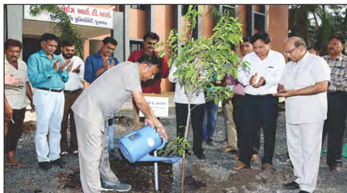
Tree Plantation at Agro Based ITI JAU, Junagadh