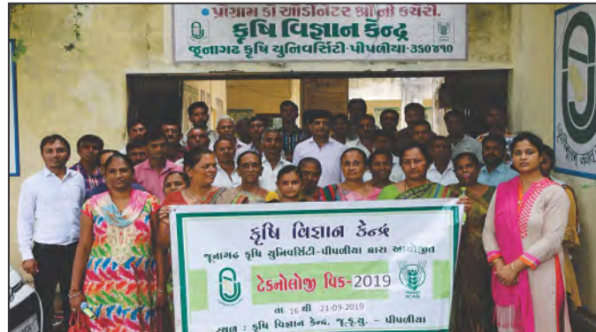
Technology Week Celebration by KVK Pipalia