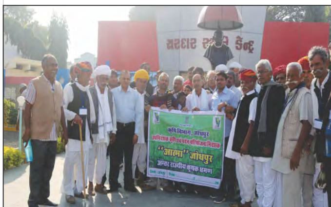
Exposure Visit of Farmers of Dist. Jodhpur (Raj.)