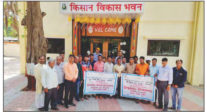
Training Programme of Quality Seed Growers & Organic Growers