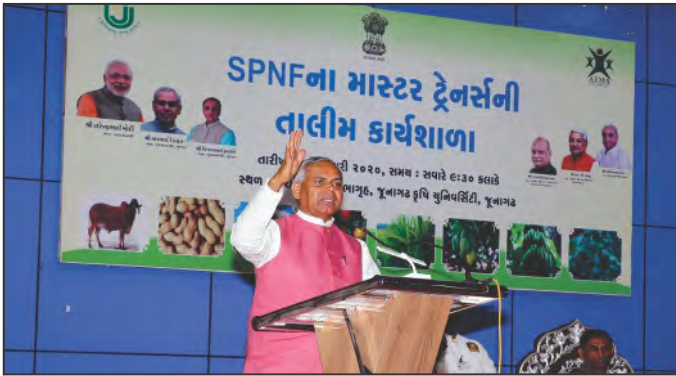
Hon' ble Governershri addressing the participants during SPNF Karyashala at JAU, Juanagdh