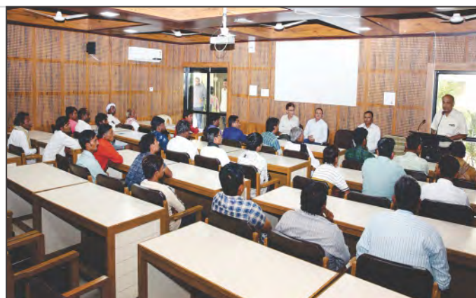
Training Programme for Farm Women of Dist. Surendranagar at SSK