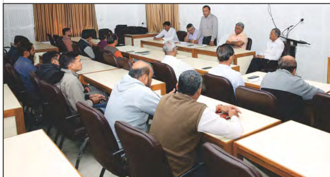
Beneficiaries of Dept. of Agriculture & KVKs in Bi-monthly Training programme under T & V scheme