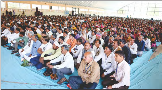
Participants of SPNF workshop at JAU, Junagadh