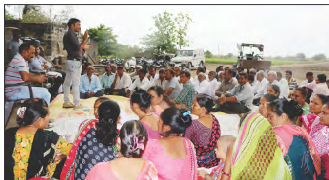
Off Campus training programme at KVK Pipalia