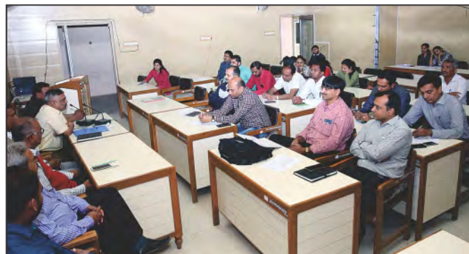
The Officers of Dept. of Agriculture, Dept. of Horticulture and KVKs in Pre-Seasonal Training programme under T & V scheme