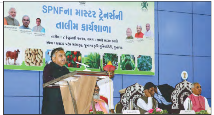
Hon'ble Vicechancellor addressing the participants during SPNF Karyashala at JAU, Juanagdh