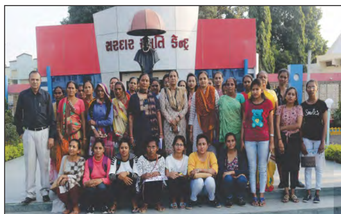
Exposure Visit of Farm Women of Dist. Patan