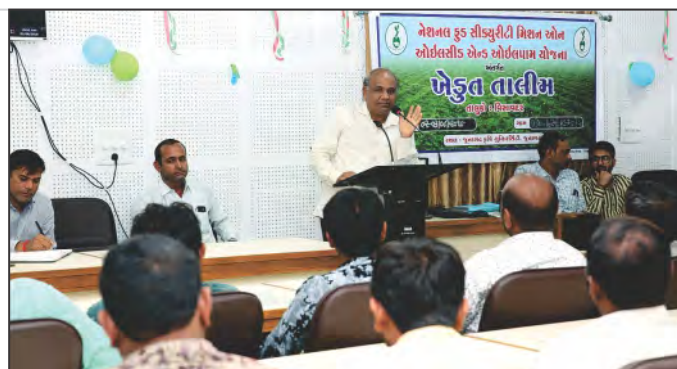
Farmers Training Under COC Scheme