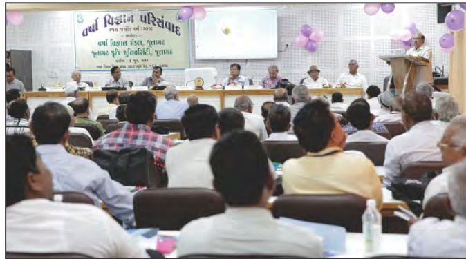
Varsa Vigyan Parisanvad at JAU, Junagadh