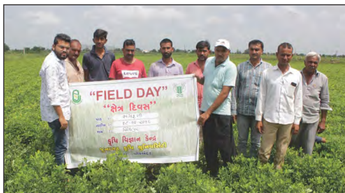
Field Day by KVK Khapat