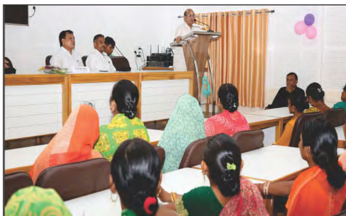
Training Programme for Farm Women of Dist. Anand at SSK