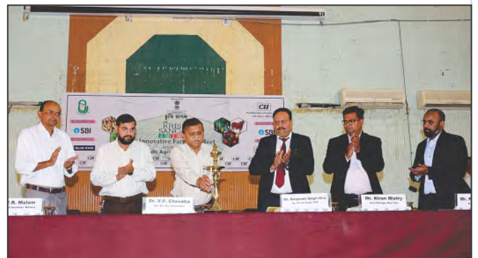
Krushi Sangam Programme at JAU, Junagadh