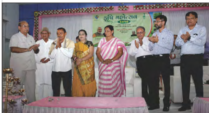
Krushi Mahotsav programme at JAU, Junagadh