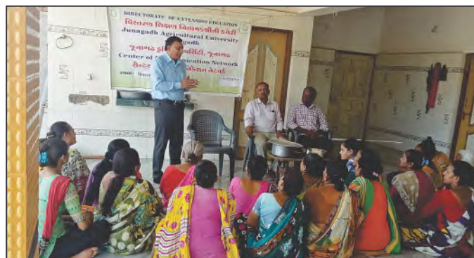
Bakery Training Under COC Scheme